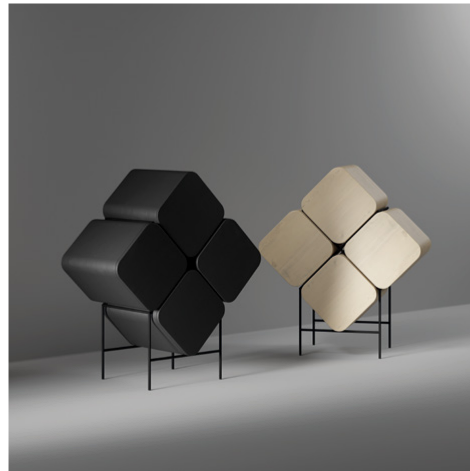
0,99*0,42*1,19 m 20 kg Ash wood, steel, powder coating

The chest of drawers from the Stern collection, made of natural solid ash wood and metal is a vivid example of «ethnominimalism» due to its black color and laconic forms. However, the unusual position of the chest of drawers, which immediately attracts attention, does not preclude its functional purpose.