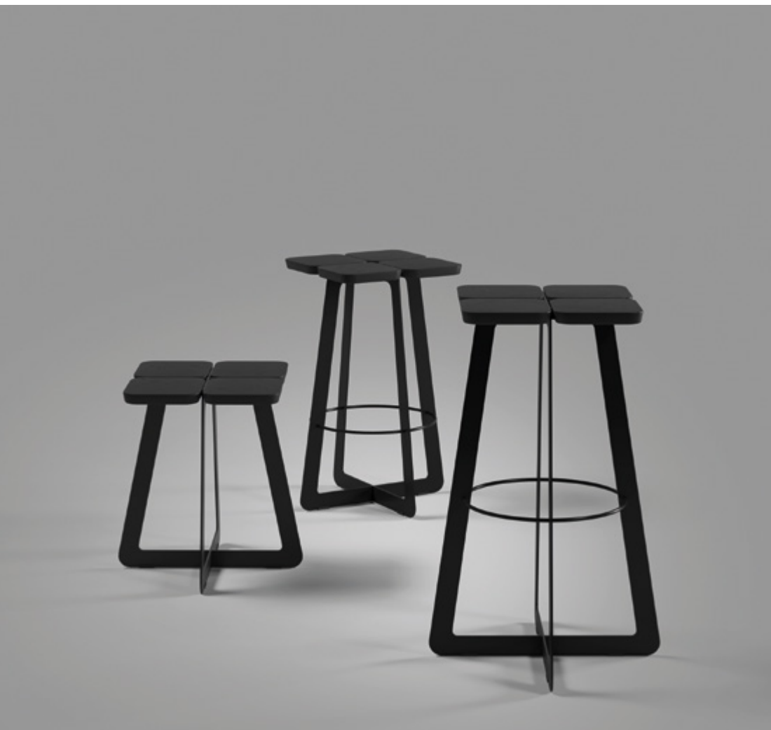
0,65*0,75* 0,45 / 650 / 750 m 7 kg Ash wood, steel, powder coating